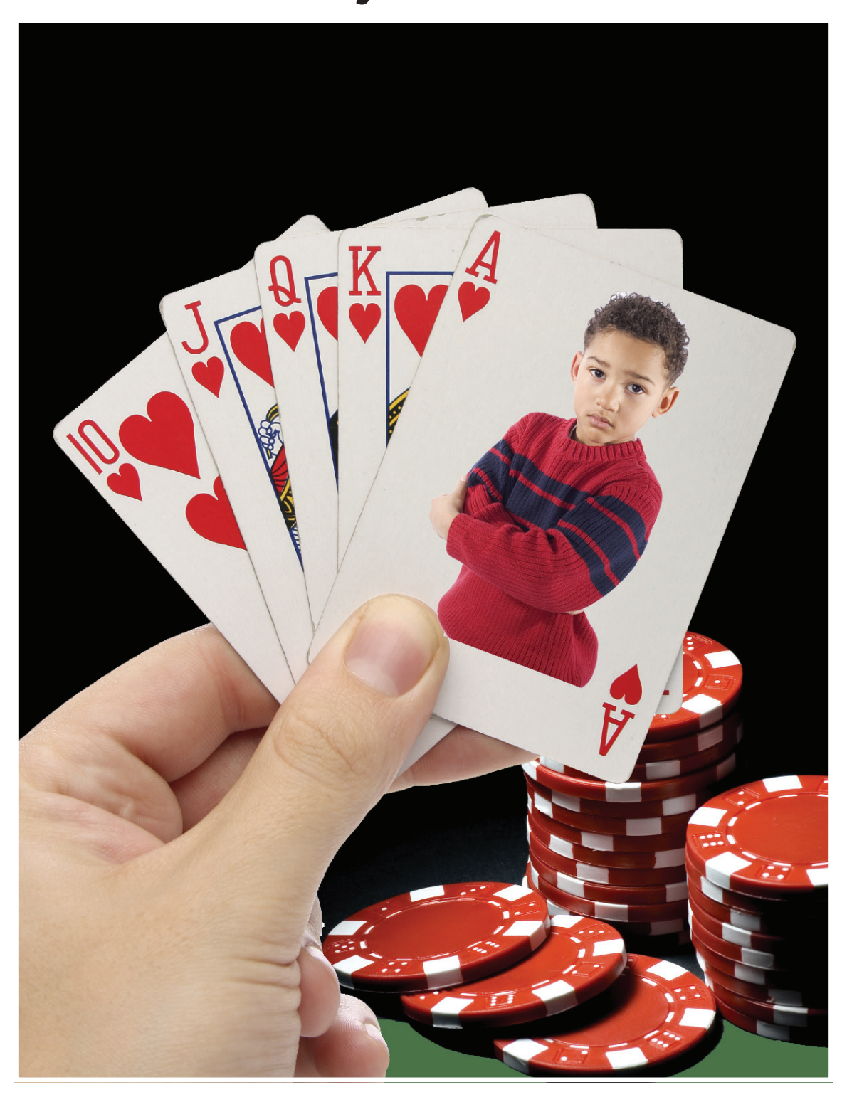
CENTER FOR MEDIA AND DEMOCRACY October 2014