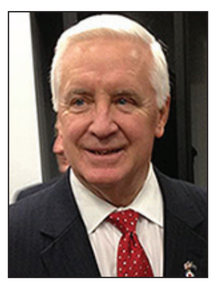
Pennsylvania Gov. Tom Corbett

While neighborhood schools are staggering, "charter schools" continue to proliferate. Public charters were first authorized in Pennsylvania in 1997. The schools receive funds from the local districts based on the per-pupil cost in that